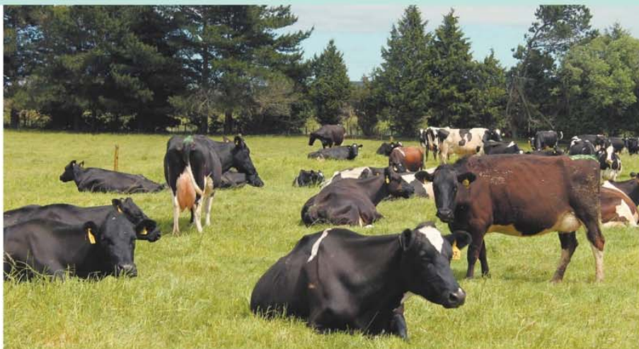
Lush meadow: The Parnwell's farm is 102ha of flat farmland just south of Broadlands, near Reporoa. and they milk around 250 mainly Friesian cows.

again" the all-grass system is re-established. The farm is particularly affected by drought so the Parnwells keep a close eye on pasture with regular walks.