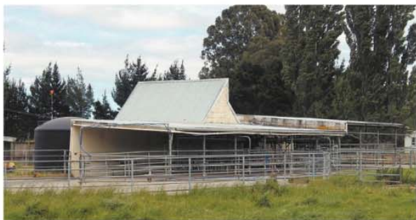
Milking shed: The Parnwells moved to their current farm in June 2005, and have spent seven years 50/50 sharemilking.