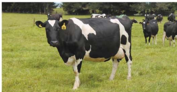
Good management: The Parnwell's feed an impressive 90 per cent of pasture as feed.